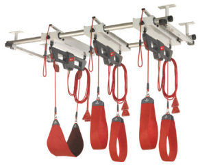
Ceiling Mounted Workstation Art. nr.: 10053