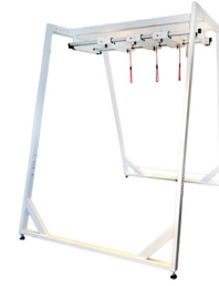
Floor Standing Workstation Art. nr.: 12193

Dimensions: Width: 201,6 cm Depth: 228.5 cm Height: 245 cm