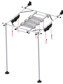
Wall Mounted Workstation Art. nr.: 10063

Dimensions: Width: 201,6 cm Depth: 228.5 cm Height: 245 cm